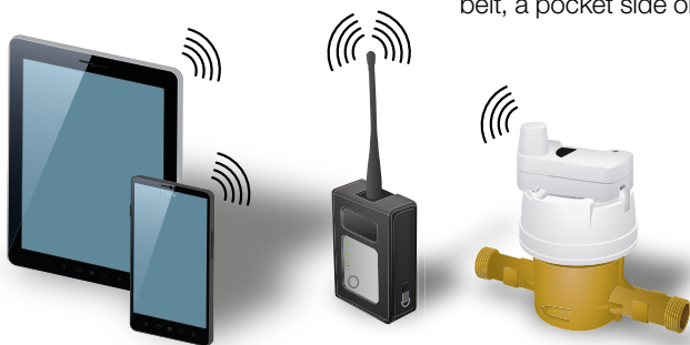
Bluetooth RF Master Architecture

It is auto – alimeted with rechargeable standard batteries- performing up to 2000 radio readings per day with batteries full-charged, large full day autonomy – 8 h permanent BT communication.