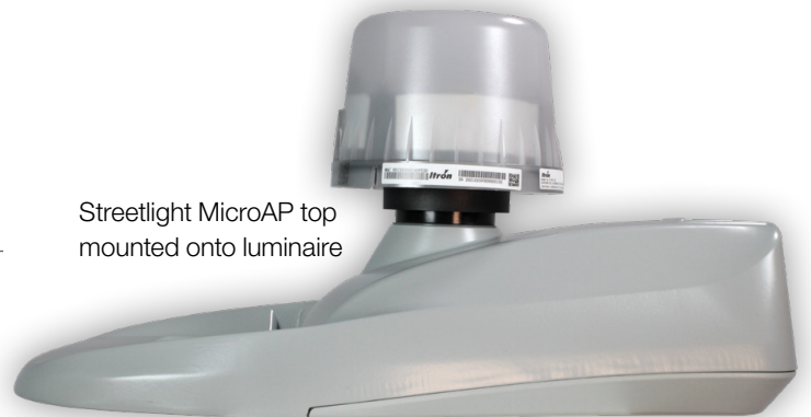
Streetlight MicroAP top mounted onto luminaire

Area lighting solutions (for example, parking lot, campus, retail outlet) – The Streetlight MicroAP is a key component of the kit required to provide simple, plug-and-play solutions for the area lighting market.